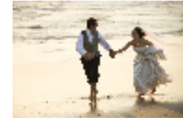
Love is strong as death